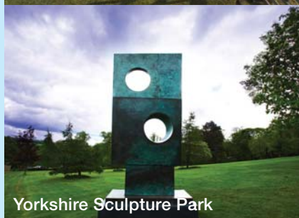
Yorkshire Sculpture Park

5 days from £549 Departing 30th August 2020