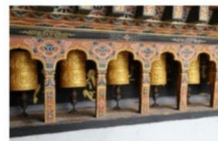
Buddhist Prayer Wheels in Bhutan