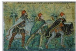
The Magi bearing gifts to the Christ Child