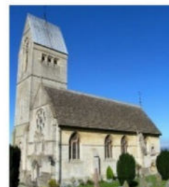
All Saints Church, Selsley

The good news is that our June visit has been rescheduled for Tuesday 18 May 2021. With the focus firmly on the Arts and Crafts Movement, the visit will take us first to All Saints Church, Selsley, the last of the great Cotswold wool churches, where we can admire the exceptional stained glass windows.